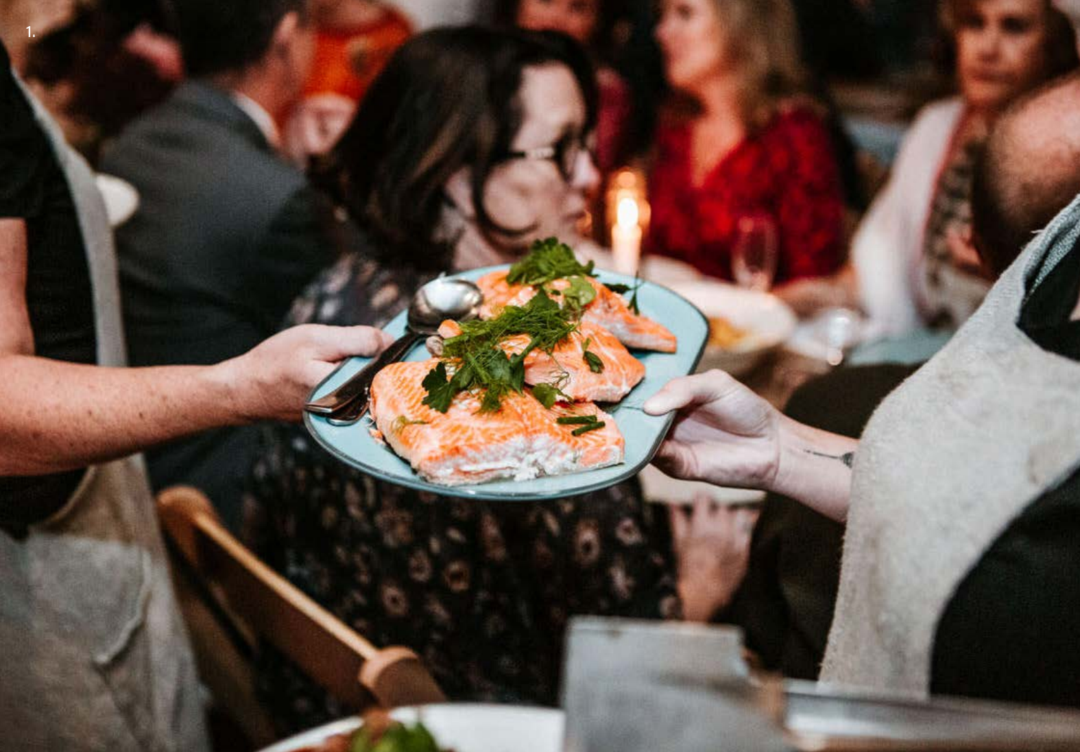
1. Red Berry Photography | 2. Two Creeks Photography

The Gunyah is a fully licensed venue with a carefully curated wine list that showcases the best of regional and NSW wines as well as offering locally brewed boutique beer and a selection of artisanal Australian spirits. Beverages can be charged based on consumption (minimum spend applies) or we also offer beverage packages to suit various budgets commencing at $75/person.