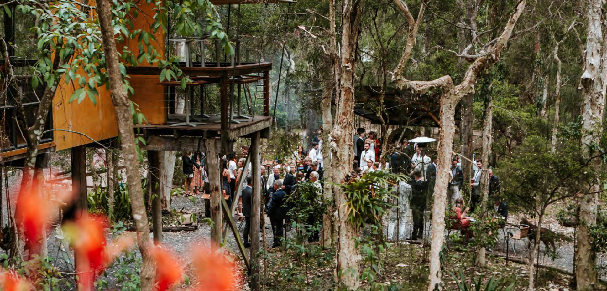
Red Berry Photography

"We have been talking a lot since, about how glad we are we chose Paperbark Camp. We were really able to realise our dream wedding and thanks to you all in helping us achieve that..."