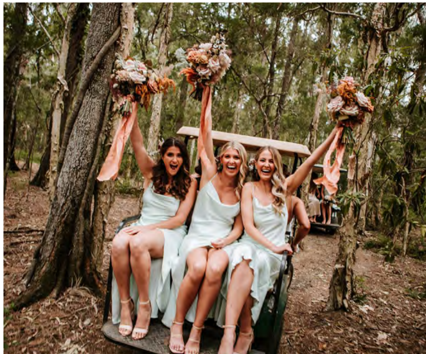
Red Berry Photography