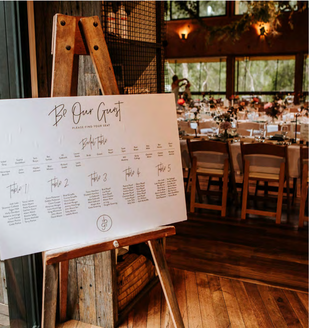
Red Berry Photography