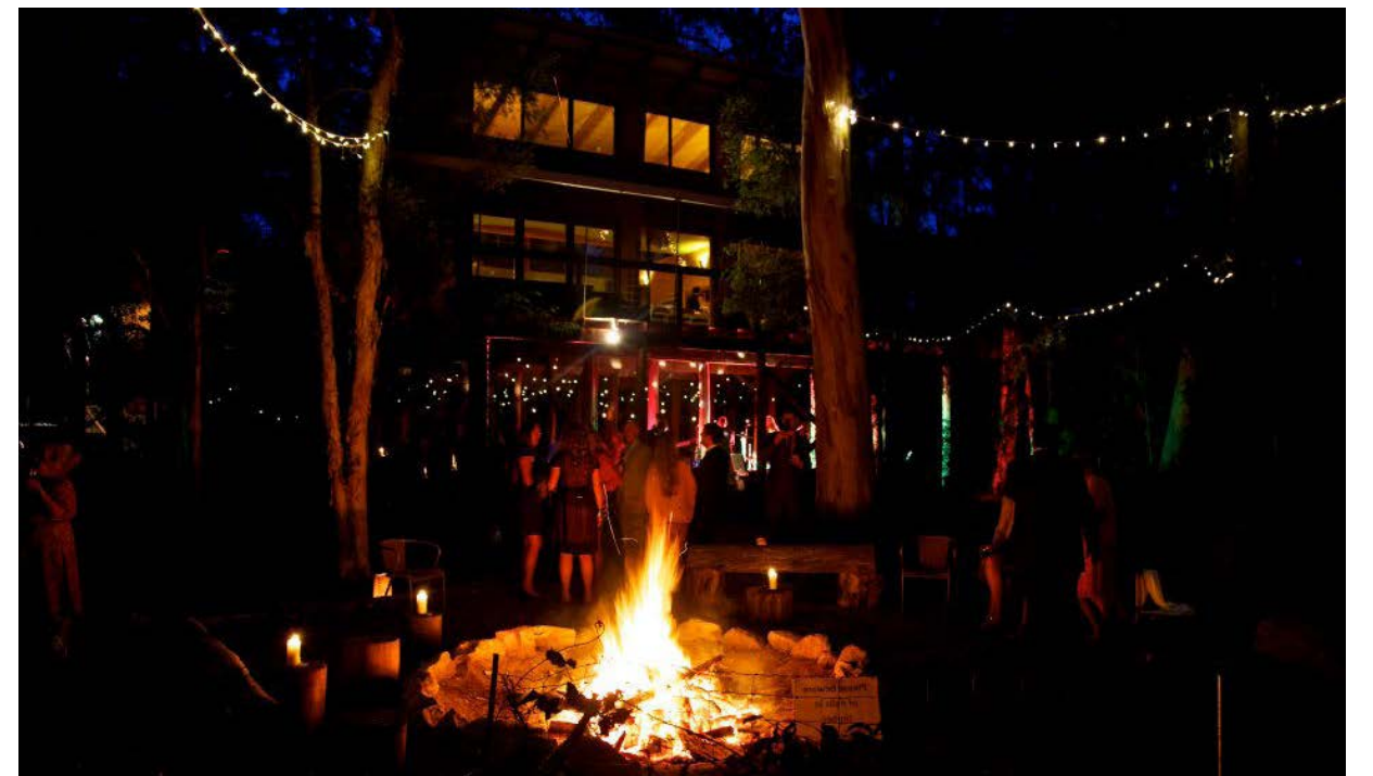
1. & 2. Red Berry Photography | 3. Katherine Willson Photography