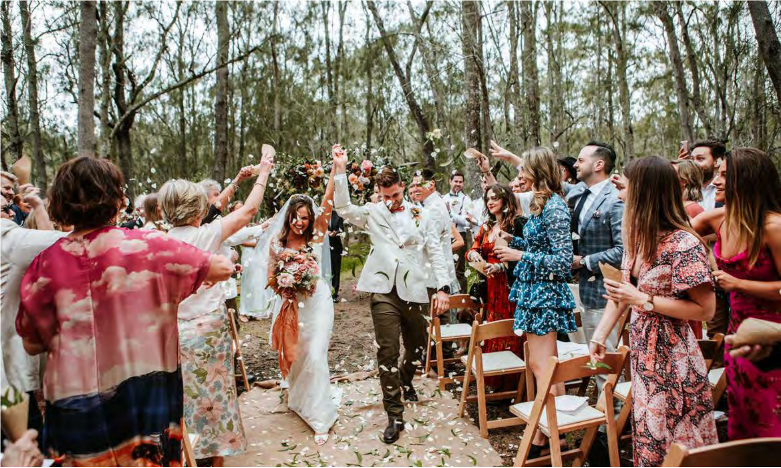
Red Berry Photography